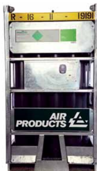
16 cylinder offshore quad

In addition, Air Products supplies baskets which can be used to carry individual cylinders.